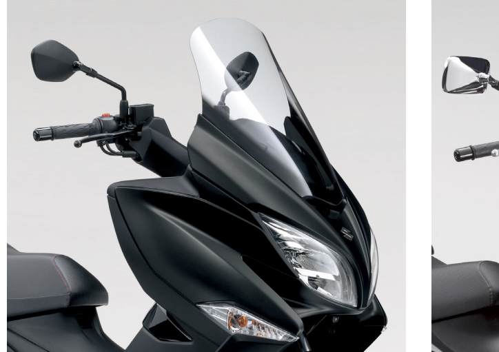
New BURGMAN 400

The new upswept windscreen design creates a cleaner, more compact look from the front or sides while delivering optimum wind protection for rider comfort and a clear view of the road. UPDATE