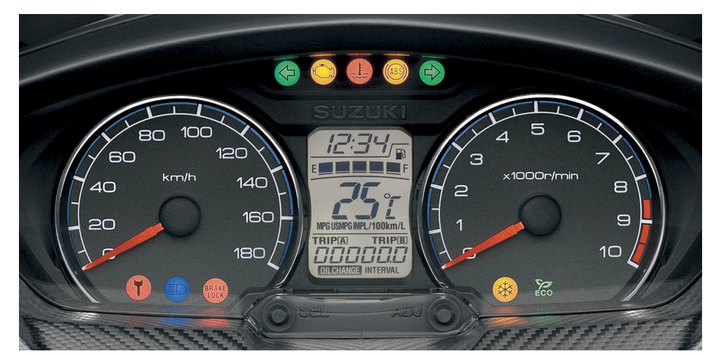
* All lights and indicators are illuminated in the photo for illustrative purposes.

Large, easy-to-read analogue speedometer and tachometer dials flank a digital display that shows an odometer, dual trip meters, fuel gauge, coolant temperature indicator, average fuel consumption meter, ambient temperature indicator, freeze indicator* and clock.