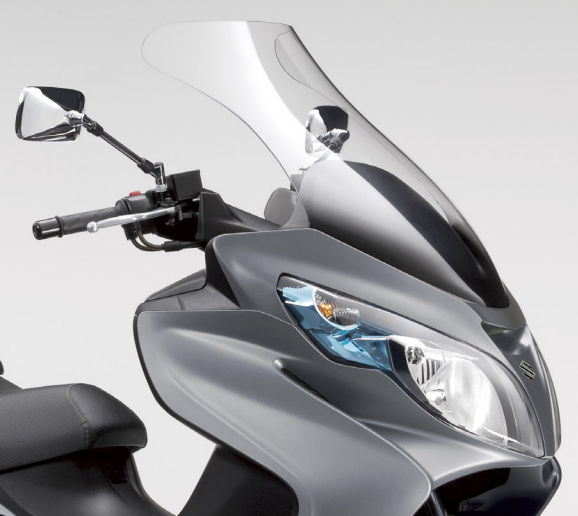
Current BURGMAN 400