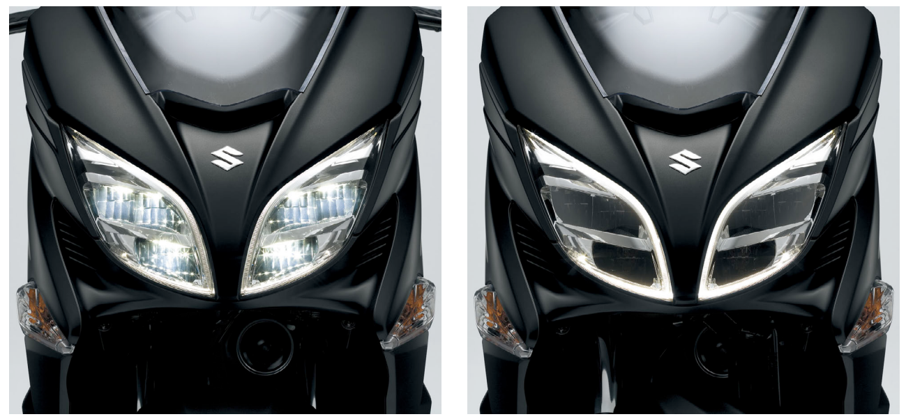
Note: All lights are illuminated for illustrative purposes.

The new nose features sharply styled dual LED headlights with integrated LED position lights and turn signals mounted beneath. The resulting effect is that of a cleaner and lighter front end that is instantly recognizable as belonging to the BURGMAN family. NEW