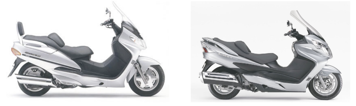
1998 BURGMAN 400

When first launched in 1998, the BURGMAN 400 pioneered a new market for large-displacement scooters. Featuring comfort, power, plenty of storage space and elegant styling, the model earned a formidable reputation as a commuter and a touring machine capable of carrying two. Refinements that coincided with a major update in 2006 enhanced the design, power and convenience, helping to further secure the BURGMAN 400's position in the marketplace.